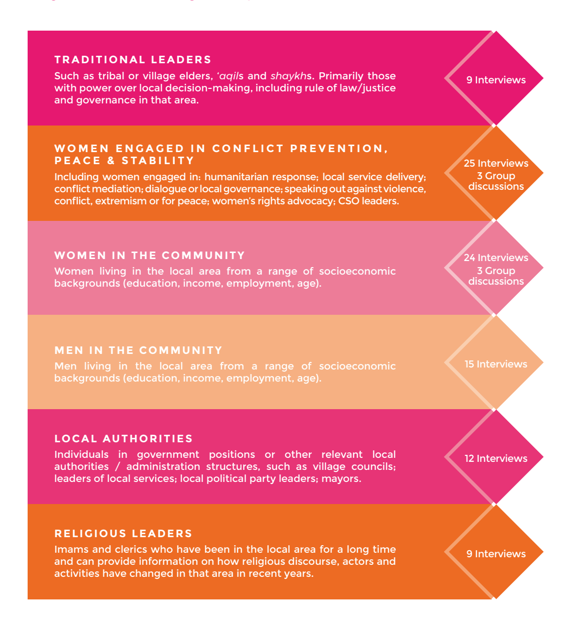
Diagram 1: Research Target Groups