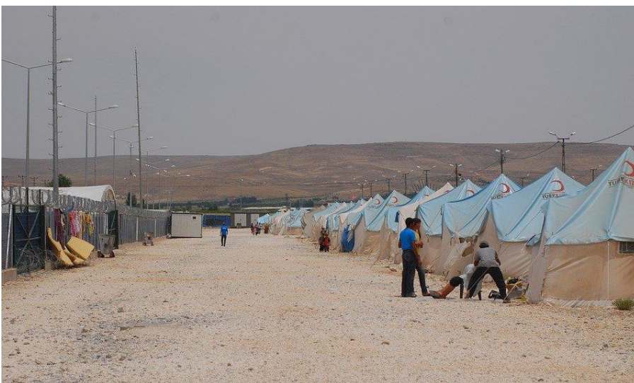
Refugee camp in Syria

Syrian adolescent girls and young women expressed an increased sense of vulnerability to violence since their displacement. Women reported pressure to marry or work by their families, both of which they perceived to increase the risks of violence.