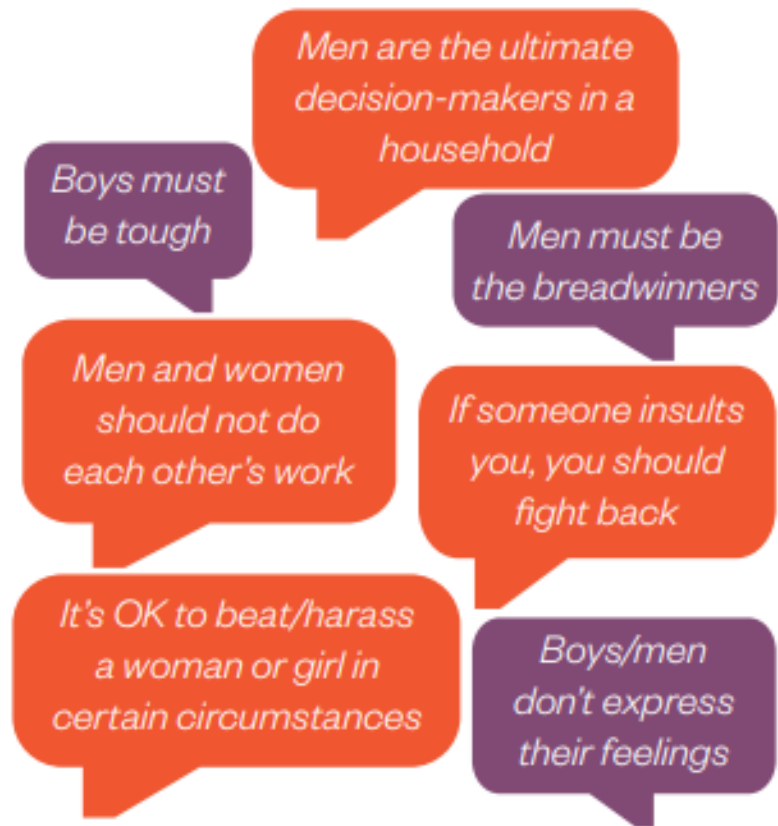
Key norms of masculinity that programmes with adolescent boys aimed to change

Programmes should explore options for scaling up work in schools and with existing community-based youth initiatives. The review also recommends stronger efforts to include marginalised groups of boys, such as boys who migrate seasonally, boys with disabilities and sexual and gender minorities.