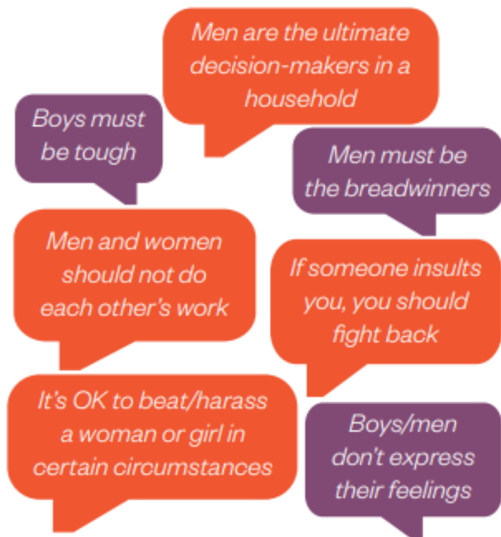
Key norms of masculinity that programmes with adolescent boys aimed to change

(December 2018) This rigorous review of 34 programmes in 22 low- and middle-income countries observes positive impacts on boys' and young men's knowledge about and attitudes to gender equality, norms